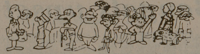
Day students get their news from the Batt.