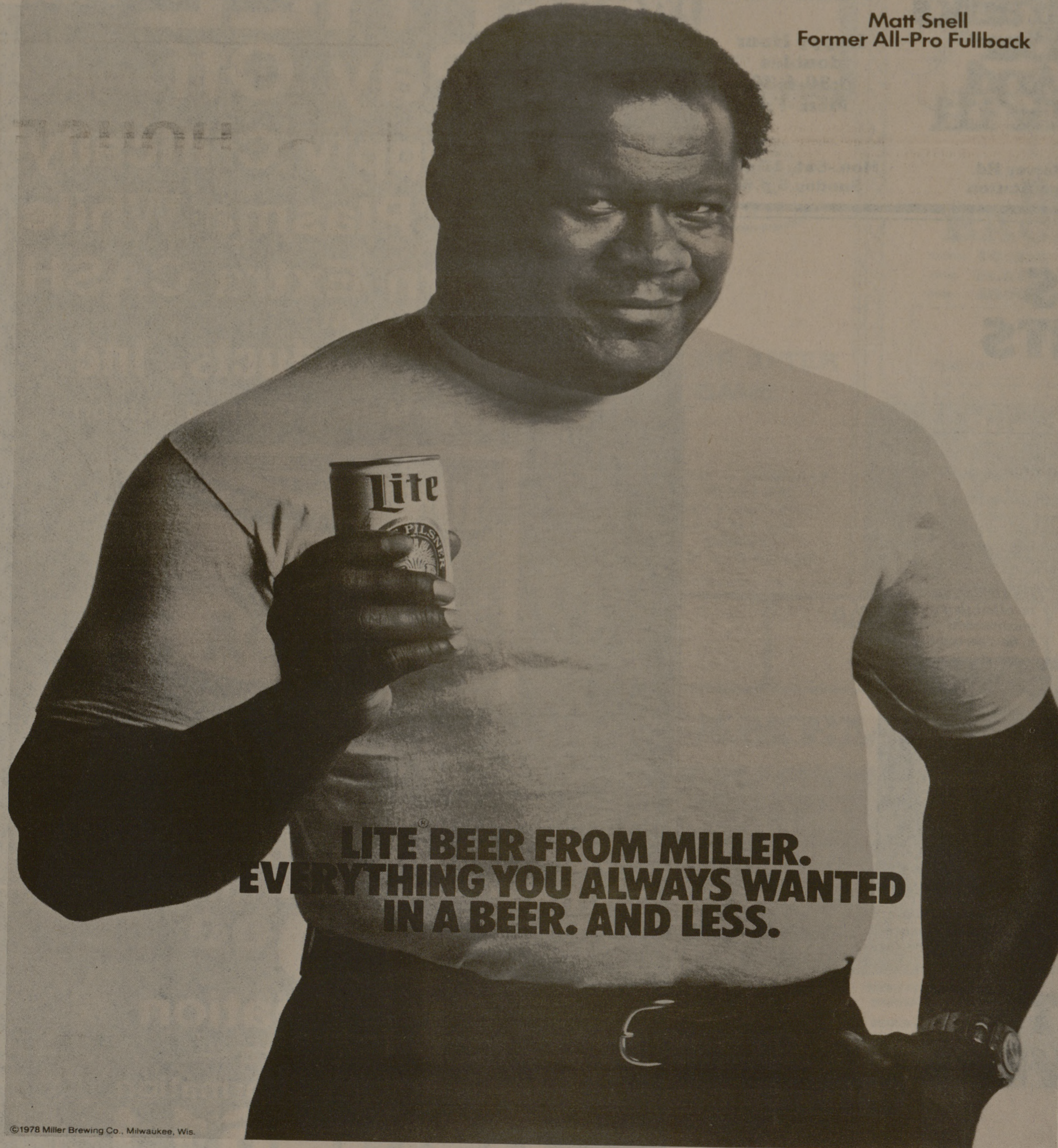
Matt Snell Former All-Pro Fullback

"BACK WHEN I WAS IN SCHOOL, I COULD'VE USED A LESS FILLING BEER. ON WEEKDAYS I CARRIED 21 CREDITS. ON WEEKENDS I CARRIED DEFENSIVE TACKLES, LINEBACKERS AND WEAK STRONG SAFETIES."