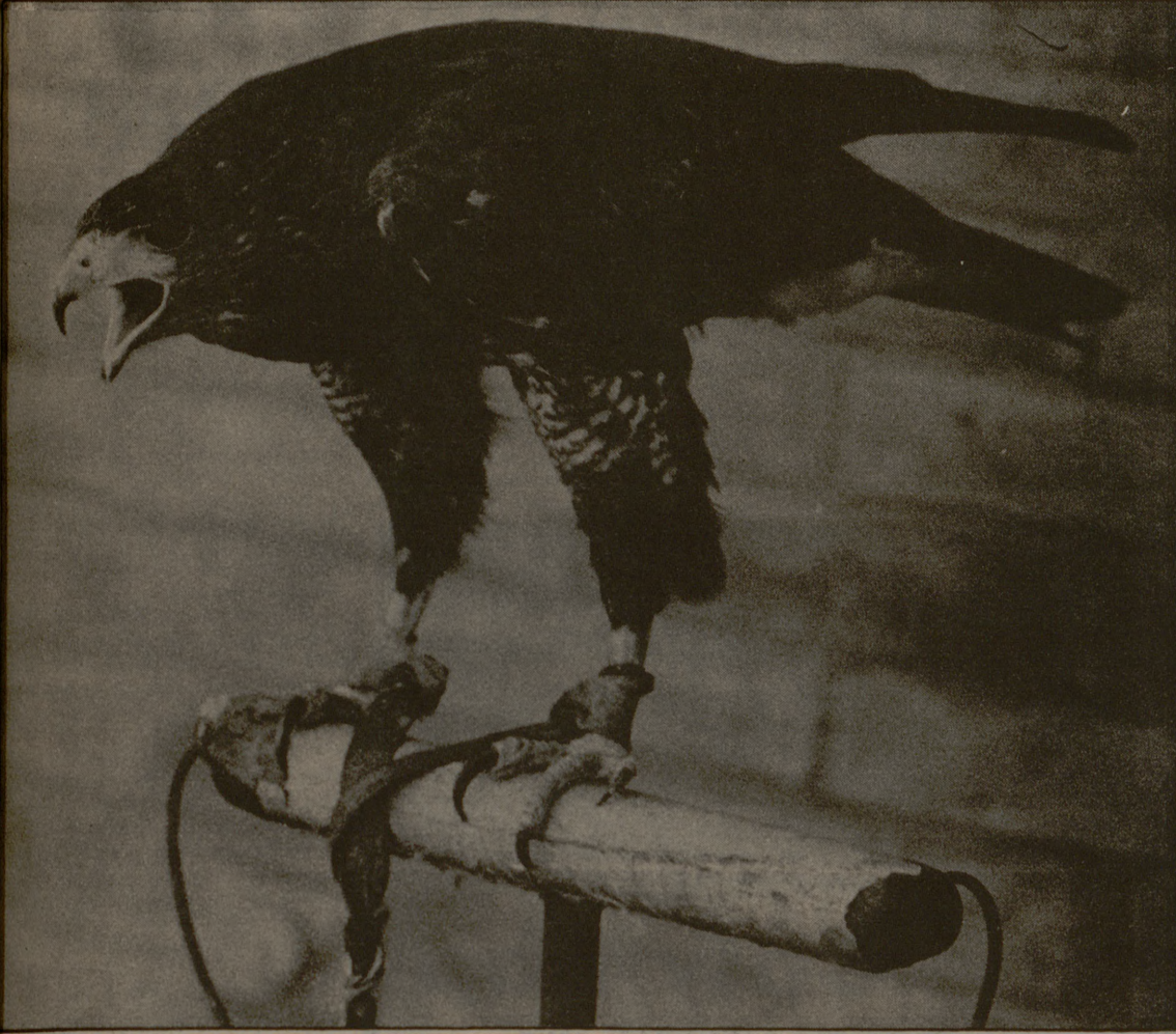
Battalion