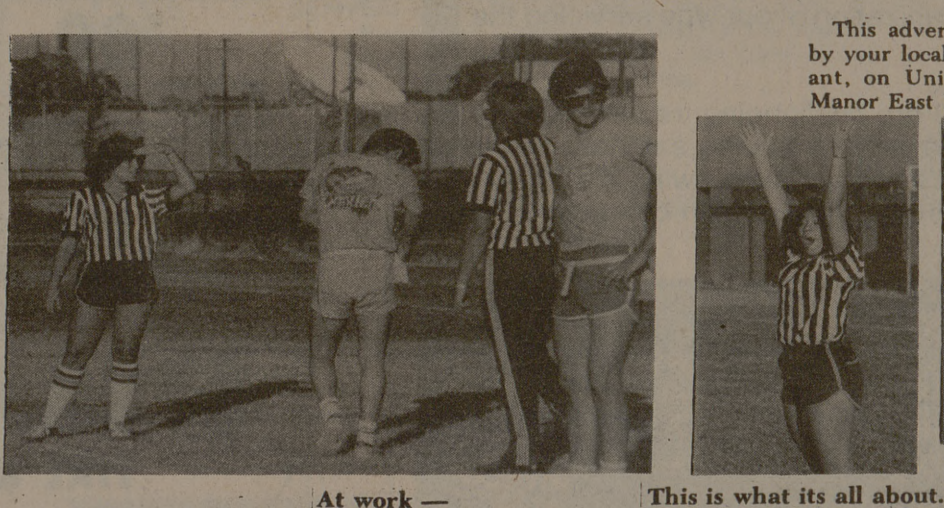
At work -