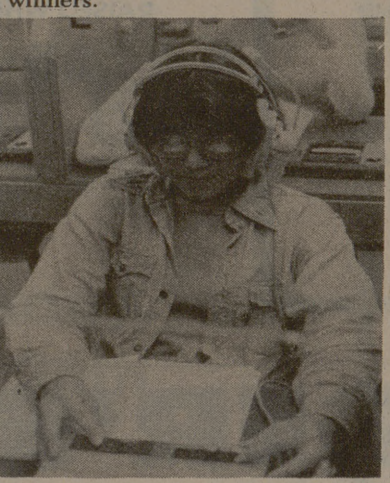
In the language lab. What a way to spend the afternoon.

Balls and paddles may be checked out from the official. T-shirts will be awarded to all winners