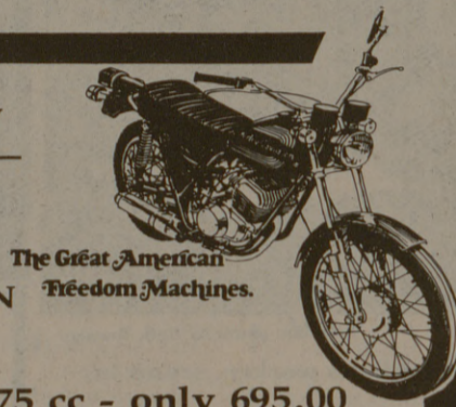
The Great American Freedom Machines.