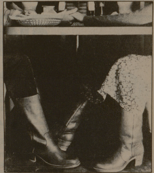
Hamburgers and Fries.