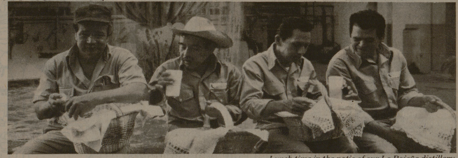
Lunch time in the patio of our La Rojeña distillery.

Bryan-College Station 3832 South Texas Avenue