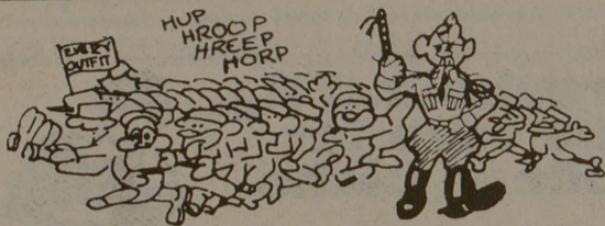
The Corps of Cadets gets its news from the Batt.