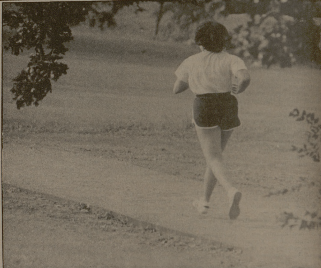
The new jogging trail, which winds through scenic south campus, is now open at all times.