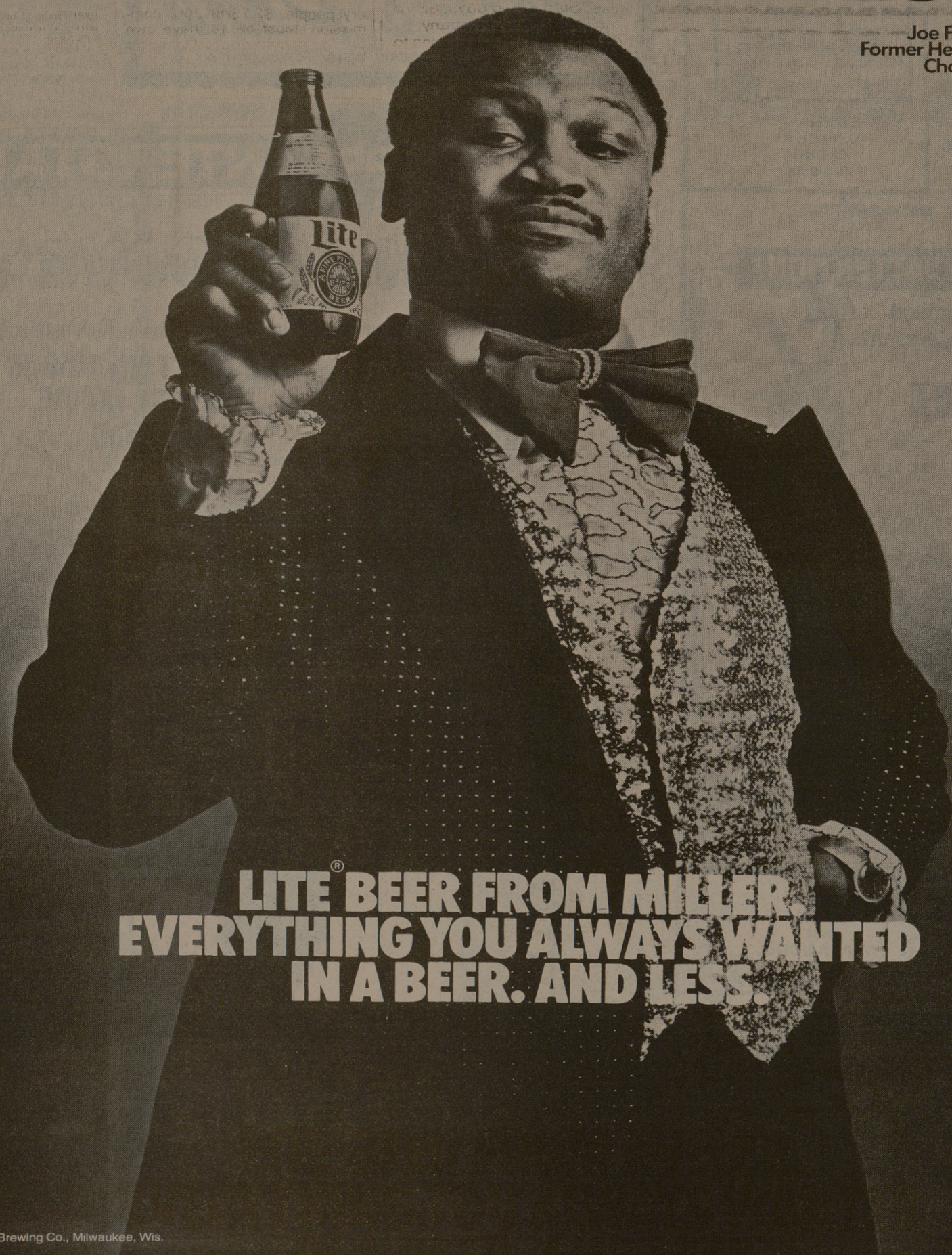
Joe Frazier Former Heavyweight Champ

LITE BEER FROM MILLER. EVERYTHING YOU ALWAYS WANTED IN A BEER. AND LESS.