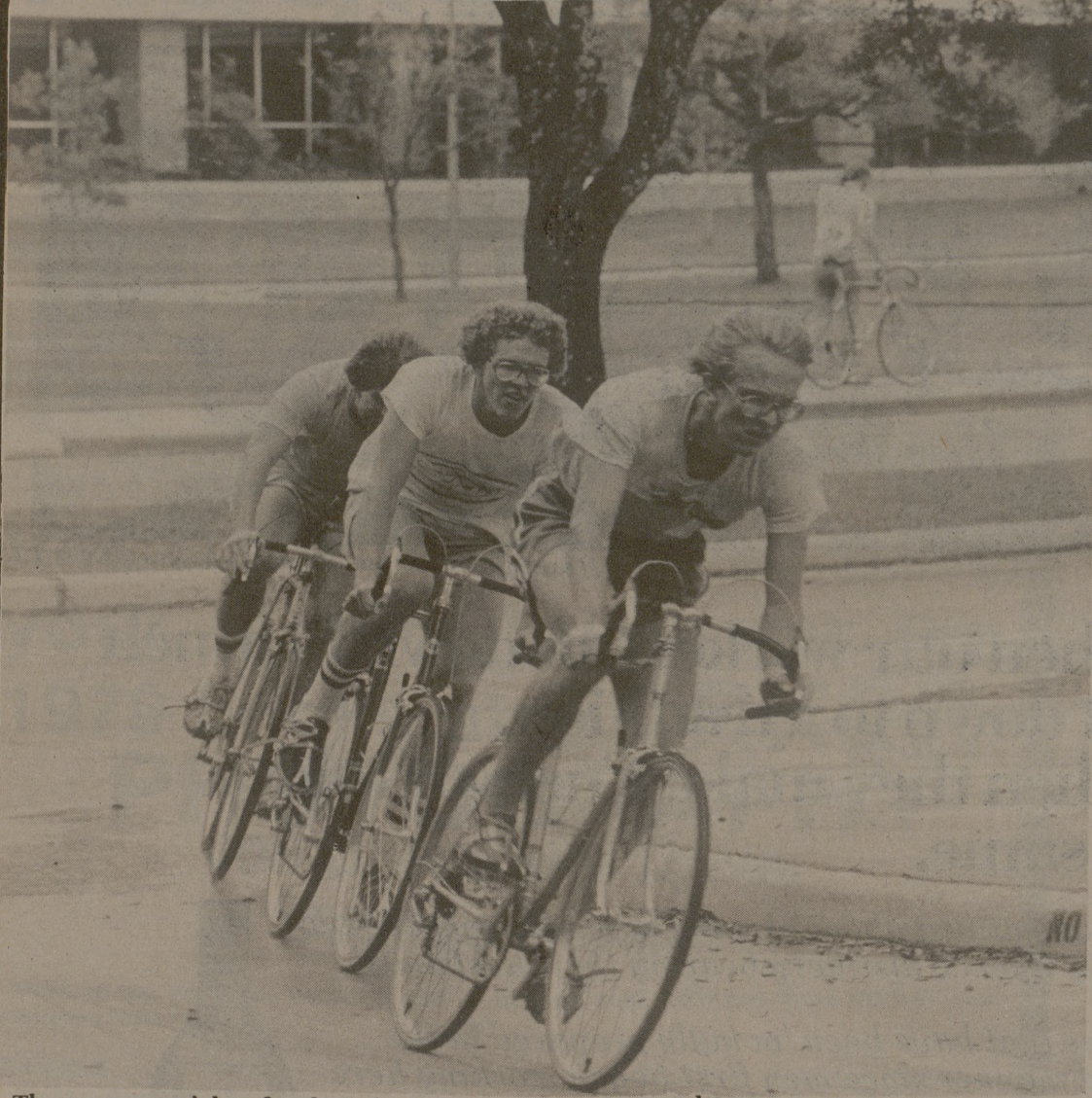
These guys aren't late for class, they're riding in last years bike race. If you're good at pumping those pedals, check into this years upcoming race.