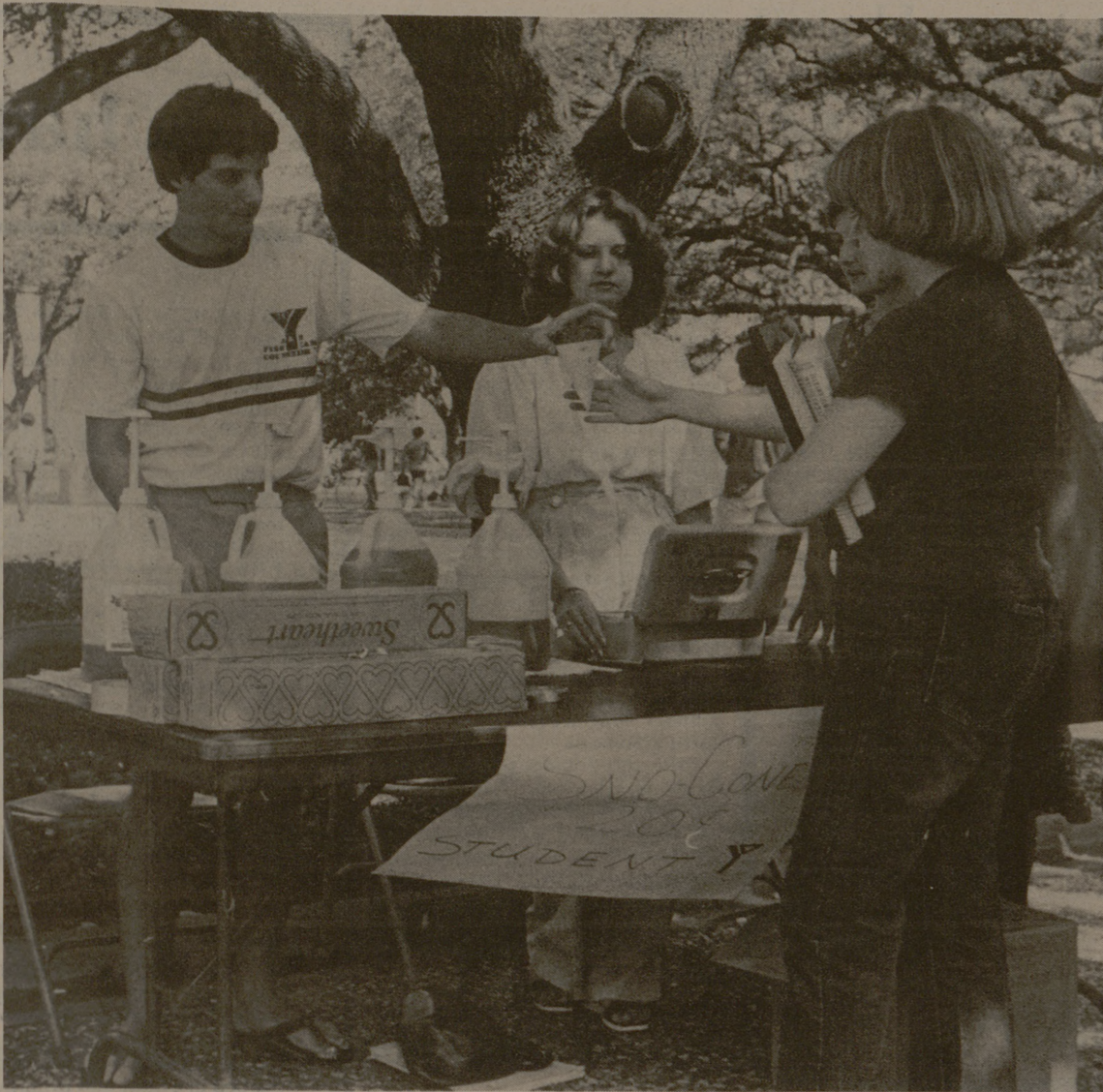
Get your snowcones here