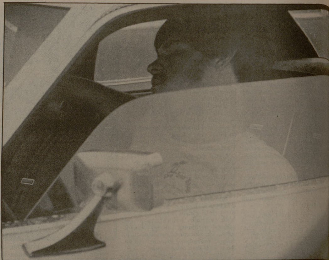
When every wink counts