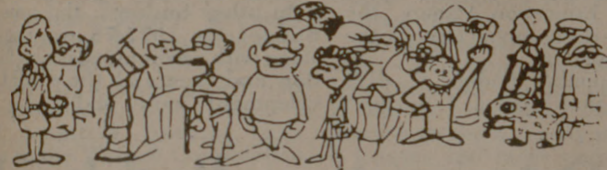
Day students get their news from the Batt.

FORMAT: 1/4 track, 2-channel stereo. HEADS: 4 (erase, record, playback, reverse playback). REEL SIZE: Up to 7". TAPE SPEED: 7 1/2, 3 3/4 ips (±0.05%). AUTOMATIC REVERSE (WITH SENSING FOIL). AUTOMATIC REPEAT PLAY. METER SELECT SWITCH FOR RECORDING HIGHER LEVELS.