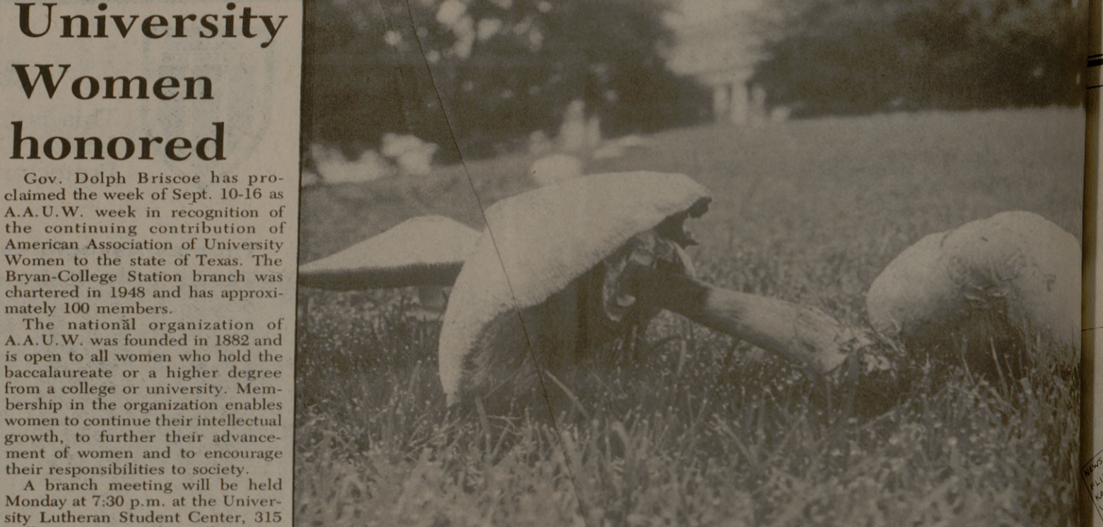
The came with the rain

Mushrooms germinated by wekend rains tem Building Sunday morning. doted the lawn in front of the Unersity Sys-