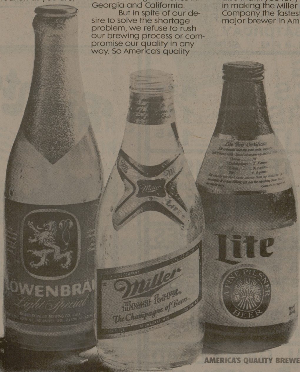
AMERICA'S QUALITY BREWER SINCE 1855

Once again, we apologize for the shortages. We also thank you for your help in making the Miller Brewing Company the fastest growing major brewer in America.