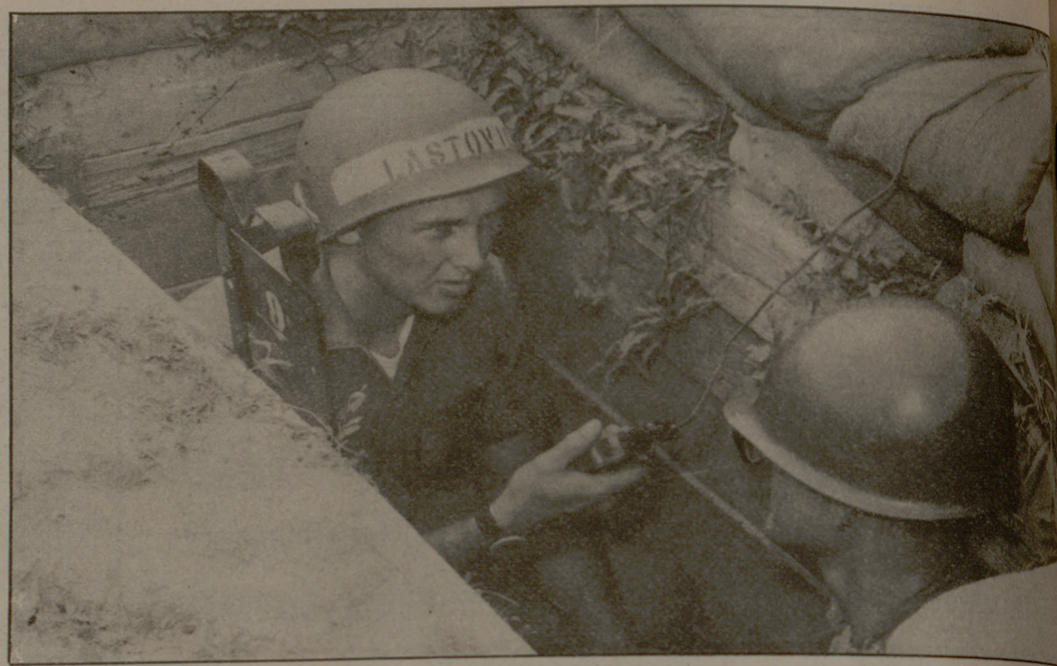
Camp experiences bring awards