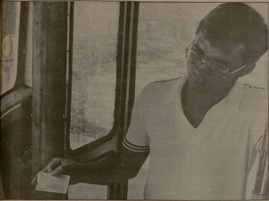
Just let me go home..