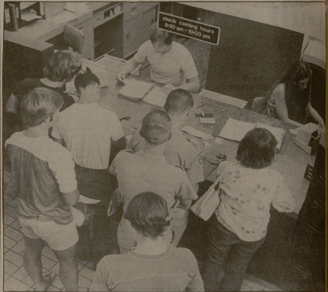
Since you've got the money, honey, we've got the time. Lines were formed all over campus Monday, including this line to cash checks at the Memorial Student Center. Check cashing hours are between 8:30 a.m. to 10:00 p.m. and an A&M identification or driver's license is needed.