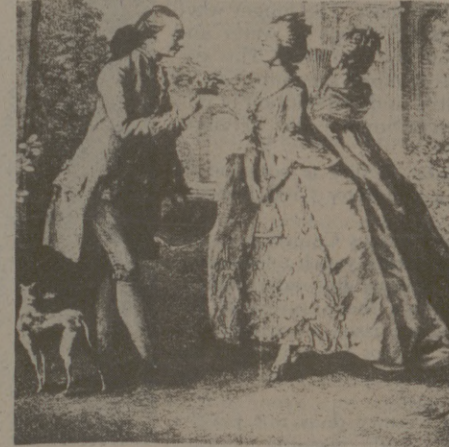
THURSDAY, MARCH 1, 1979 TEXAS OPERA THEATER performing COSI FAN TUTTE

In Paris, L'ORCHESTRE'S sensational debut was marked by the kind of extraordinary anticipation accorded only a few concerts in any year. Winner of two of France's top awards, the Prix de L'Academie de Disque and the Prix de L'Academie Charles-Cross, L'ORCHESTRE'S performances are constantly received "with a profusion of interminable ovations". Entremont's scintillating combination of French brio and brilliance, his innate musicality, extraordinary artistry and phenomenal technique place him "in the select company of the world's finest pianists". OPAS is proud to present this dynamic, exciting orchestra on its debut tour of the United States.