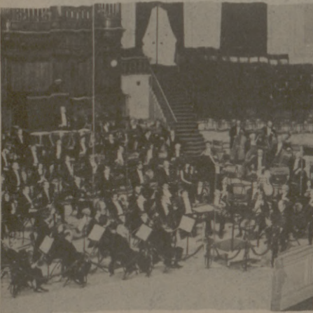
THURSDAY, NOVEMBER 2, 1978 ORCHESTRE du CAPITOLE de TOULOUSE — Michael Plasson, Conductor and Philippe Entremont, Guest Soloist

Swirling figures, leaping men, beautiful women, colorful costumes and exciting music combine to make A FESTIVAL OF RUSSIAN DANCE an evening of entertainment not to be missed. A kaleidoscope of dance from all areas of the Soviet Union, the company is composed of the finest dancers Russia has to offer. The Georgians thrill you as they dance "en pointe", the women do traditional "round" dances with all their lyrical beauty; and all the joy, exultation and virtuosity associated with Russian dance abounds. See A FESTIVAL OF RUSSIAN DANCE — you'll be enthralled.