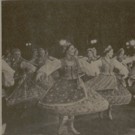
THURSDAY, FEBRUARY 15, 1979 A FESTIVAL OF RUSSIAN DANCE