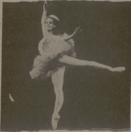
WEDNESDAY, OCTOBER 18, 1978 HOUSTON BALLET performing "THE SLEEPING BEAUTY"

MSC-OPAS (OPERA and Performing Arts Society) cordially invites you to a season of entertainment by nationally and internationally recognized artists. Let yourself relax and revel in the following outstanding events.