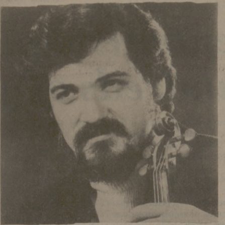
TUESDAY, NOVEMBER 14, 1978 PINCHAS ZUKERMAN, VIOLINIST

this is one of Mozart's merriest musicals, about a cynical old bachelor determined to prove that all women are fickle. Two young couples fall prey to his plot, and their amorous antics are pure fun. This opera was first produced in Vienna in 1790 and consists of two acts. The TEXAS OPERA THEATER has wonderful costuming, makeup and setting; meticulous direction, plus generous quantities of talent. COSI FAN TUTTE is energetic, entertaining, and in English; so it's easy to understand. A delightful evening for the whole family.