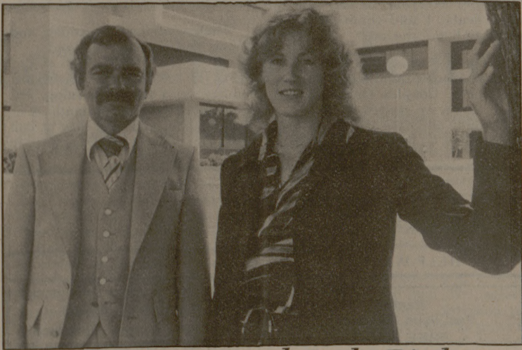
Aggies guard Lady Bird