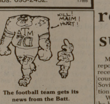
The football team gets its news from the Batt.

Eager to find lost male Pekinese-Sheltie dog. Missing from K-Mart area since June 30. Reddish-blond fur. Wt. 25 lbs. 693-2452. 1786