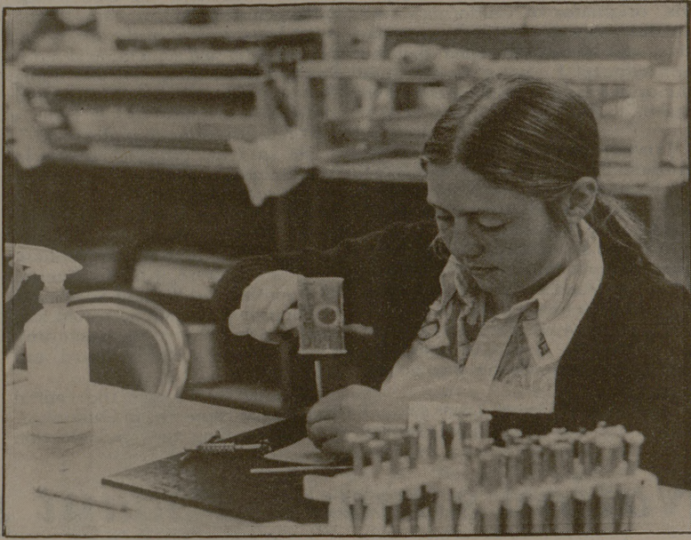
Taking a break from summer classes, this student turns her creative impulses into a hand-tooled leather purse at the Craft Shop in the basement of the MSC.