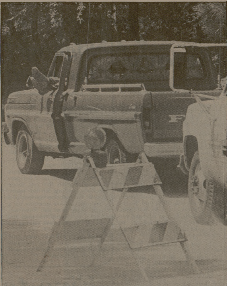
Catching 40 winks

are a thing of the past," one diplomat said. "Revenge is the password and revenge they will have." The elder Franjeh made no immediate public comment on the attack. As news of the killing spread through north Lebanon, Franjeh supporters in several villages cut roads and manned barricades, travelers from the north reported. Syrian units of the 30,000-man Arab League peace-keeping force quickly moved in and restored relative calm. Egyptian President Anwar Sadat said in a cable of condolence to the elder Franjeh the Lebanon crisis posed a threat to the entire Arab world and offered Egypt's good services to solve it. "This painful tragedy makes the heart of every Arab bleed," Sadat said. "This escalating crisis poses a threat not only to your country but to the entire Arab world."