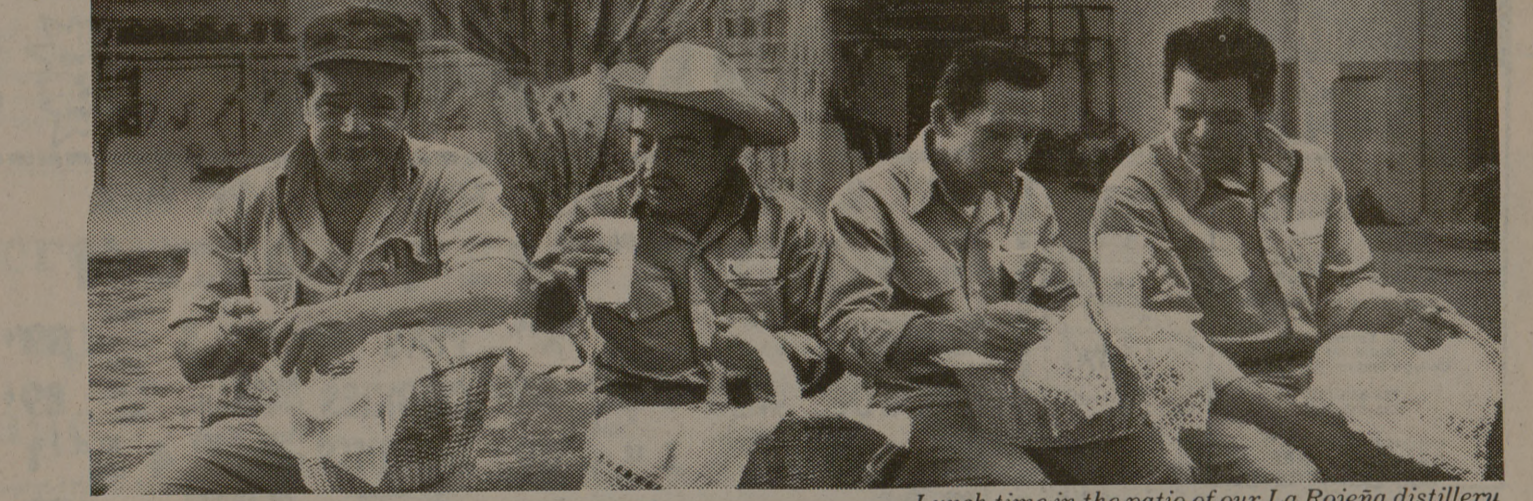
Lunch time in the patio of our La Rojeña distillery.