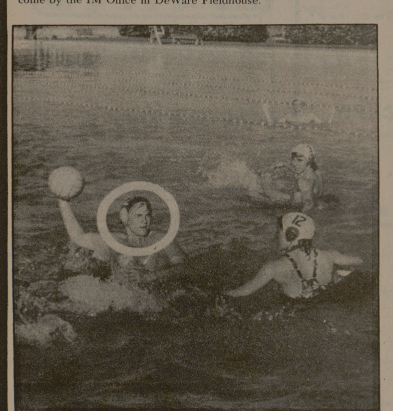
"I SPY'S" PARTICIPANT OF THE WEEK

Monday thru Friday 12:00 p.m.- 2:00 p.m. 2:00 p.m.- 5:00 p.m. Saturday and Sunday For information call 845-7826, for court reservations call 845-2624, or come by the IM Office in DeWare Fieldhouse.