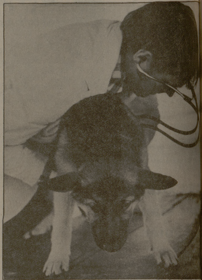
Battalion photo by K...

Agencies conducting investigations were the Occupational Safety and Health Administration, the U.S. Transportation Department's Office of Pipeline Safety, the state Office of Pipeline Safety, the State Labor Department and the State Corporation Commission. Davis said it was unusual for manhole caverns to be as deep as 8 feet, the depth of two caverns built by the shopping center where the accident occurred. Usually, the caverns are only 4 to 5 feet deep, he said. He added that with the more shallow holes "there's a chance for better ventilation." He also said it was unusual for such a plug to be used in the manner it was. The workers were restoring gas service to the shopping center — a routine job — when the gas leak occurred, Davis said. "We don't know why, in this instance, there was a leak from the plug," Davis said.