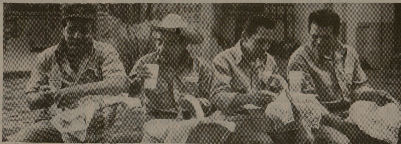
Lunch time in the patio of our La Rojeña distillery.

When our workers sit down to lunch they sit down to a tradition. When they make Cuervo Gold it's the same.