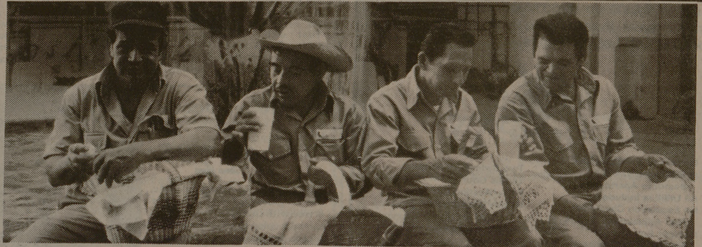
Lunch time in the patio of our La Rojeña distillery.

When our workers sit down to lunch they sit down to a tradition. When they make Cuervo Gold it's the same.