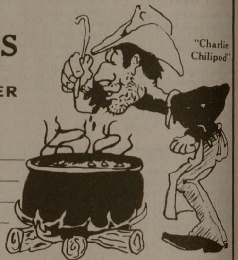
"Charlie Chilipod" "Dawn to Dusk"

MAIL TO: B-CS JAYCEES BOX 3535, BRYAN, TX. 77801