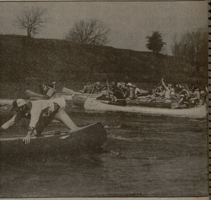
The Brazos River saw a lot of action last March 25th during the Intramural Canoe Race. Shown here is the rush and congestion which accompanied the start of each race.