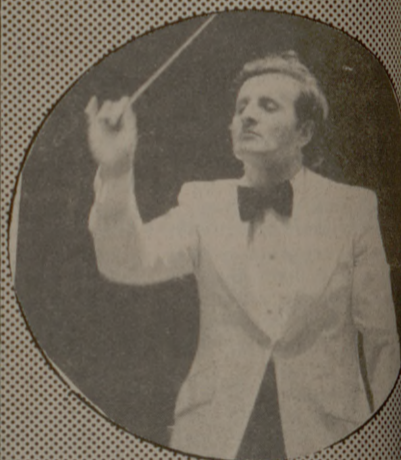
DALLAS SYMPHONY ORCHESTRA Eduardo Mata, conducting

Tickets Available at MSC Box Office 845-2916 Zone 1 Texas A&M Student $5.80 Regular $7.25 Zone 2 Texas A&M Student $4.65 Regular $5.80 Zone 3 Texas A&M Student $3.70 Regular $4.65 Tuesday, April 4, 1978 7:30 p.m. Rudder Auditorium