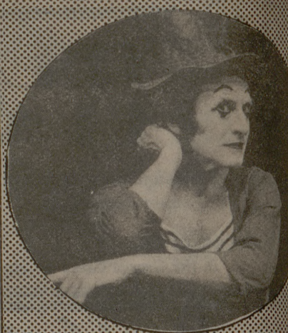
MARCEL MARCEAU World famous pantomimist