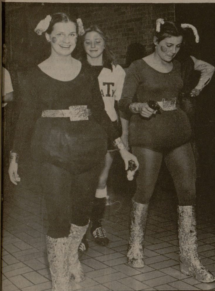
Battalion photo by Malcolm Moore

If an organization is taken off the books, it must reapply for official recognition.