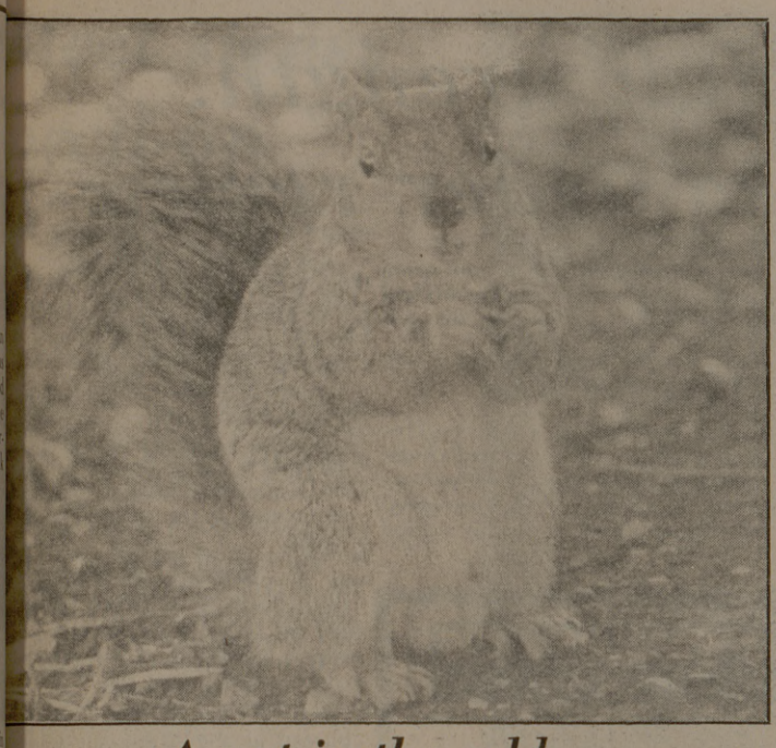
A nut in the cold

hile acorns and temperatures have dropped this week, stuents have found it good weather to keep up on their study-