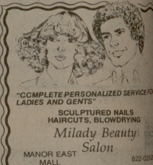
MANOR EAST MALL 822-0252

Swismograph Service Corporation A SUBSIDIARY OF RAYTHEON COMPANY P.O. BOX 1590 • TULSA, OKLAHOMA 74102 • (918) 627-3330