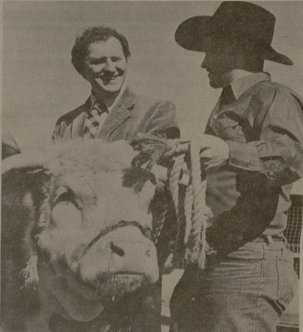
YOU'RE A WINNER—Congressman Bob Krueger of Texas congratulates a young Texan for his prize-winning Hereford heifer at a recent livestock show. Krueger, who made his 5th annual tour of junior livestock competition in January, visited with 4-H and FFA members at over 20 shows encouraging them to continue their commitment to agriculture. A rancher himself, Krueger is also campaigning throughout the state for the U.S. Senate seat presently held by John Tower.