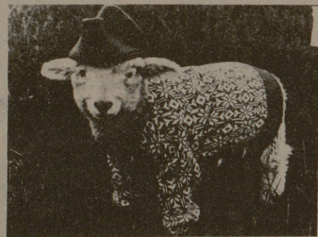
Tom's Pants has sweaters for this baa-aa-d weather.

1/2 PRICE SALE ON ALL SHRITS, SWEATERS & BELTS.