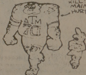
The football team gets its news from the Batt.

Some part-time jobs can get you IN STATE TUITION, interrupt your education and even help you in studies.