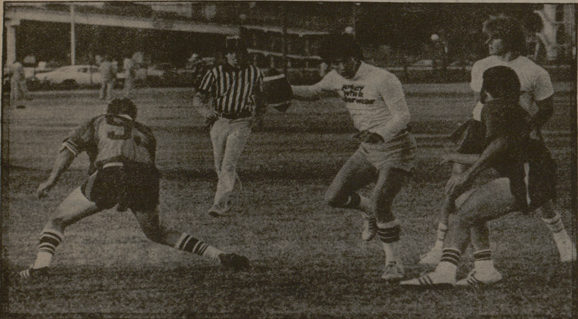
Here a player from the independent football team, Jockey Underwear, threaded his way through defenders for Hart Hall. Hart Hall #1 won the class B All-University men's football competition.

This ad is sponsored by McDonald's on University Drive and Manor East Mall and under the direction of the IM Office.