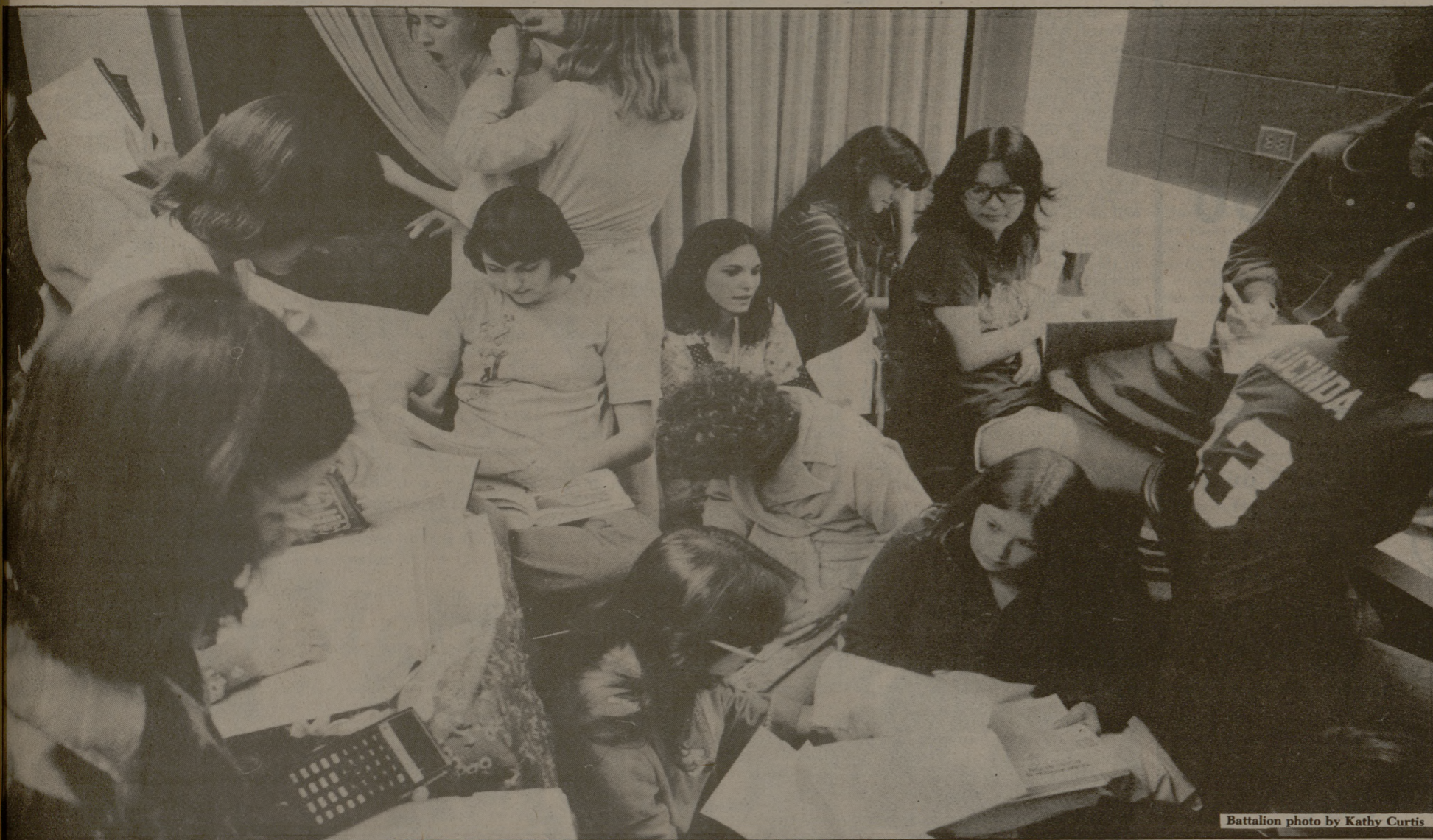
About twice each year a strange phenomenon, termed "cramming" by sociologists, occurs in some of the Texas A&M dorms.