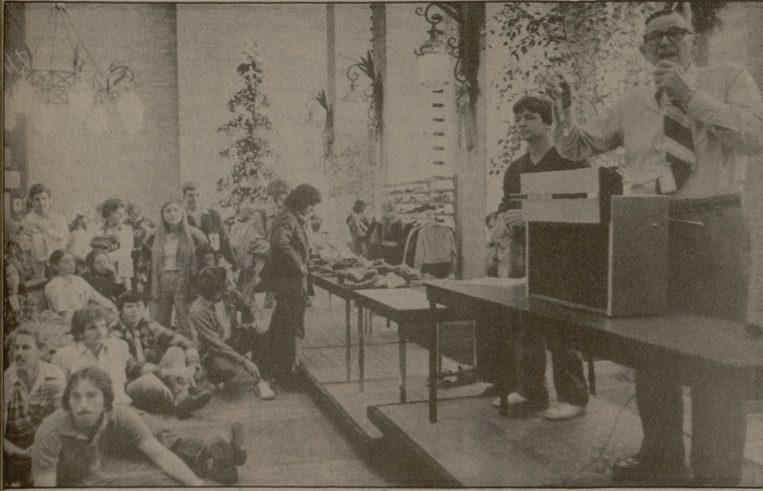
Battalion photo by Susan Webb