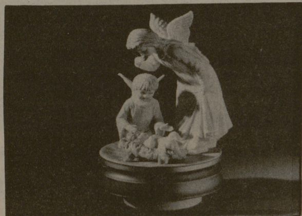
Bisque musical creche, 8½" high. An exclusive work of art from the Gift World of Gorham. $25.00.

But as we all know, averages and records don't mean a thing when Texas and the Aggies go to war.