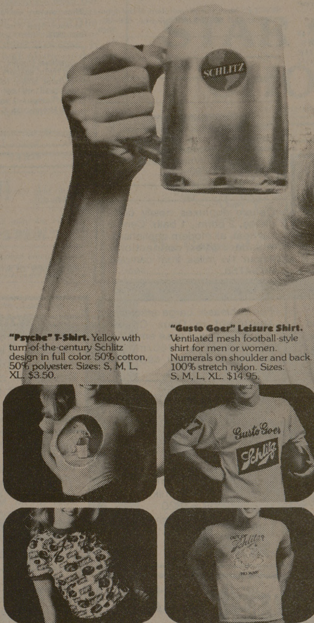
"Psyche" T-Shirt. Yellow with turn-of-the-century Schlitz design in full color. 50% cotton, 50% polyester. Sizes: S, M, L, XL. $3.50.