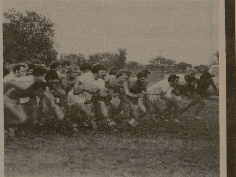
At the sound of the gun, bodies lunge forward to establish an early lead in last Monday's cross country race. The racers followed a 2.2 mile route over the campus polo field.