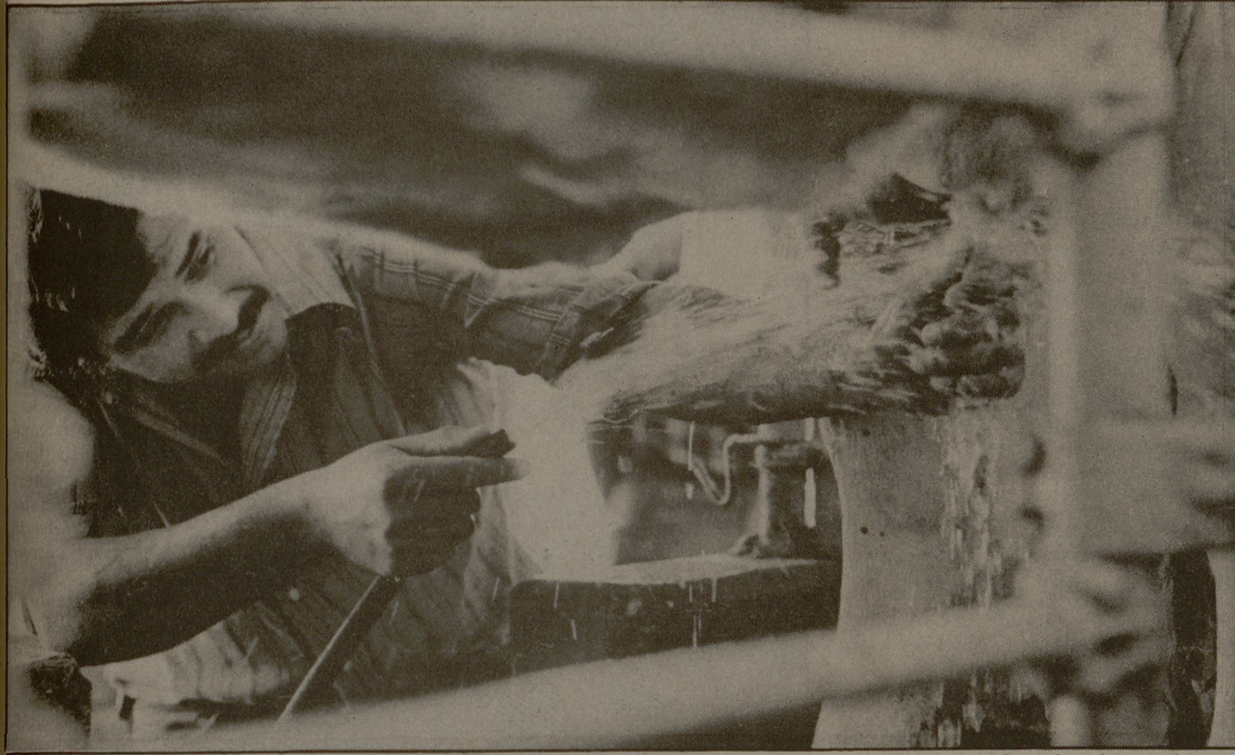
Milking by machine