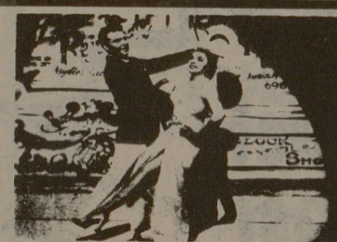
A STAR IS BORN Judy Garland, James Mason, Jack Carson, Charles Bickford, Tom Noonan, Lucy Marlowe

WEDNESDAY OCT. 19 RUDDER THEATER 8:00 P.M. $1.00