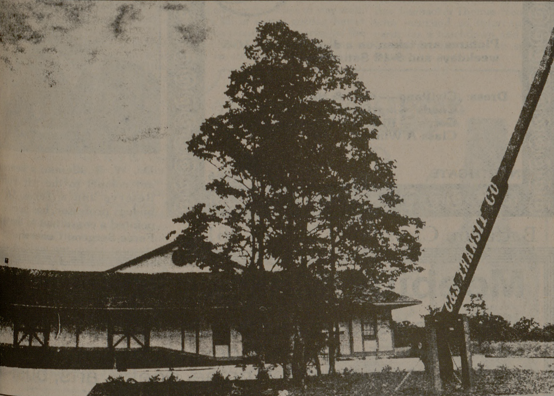
The C&S Transit Co. on Harvey Road, College Station