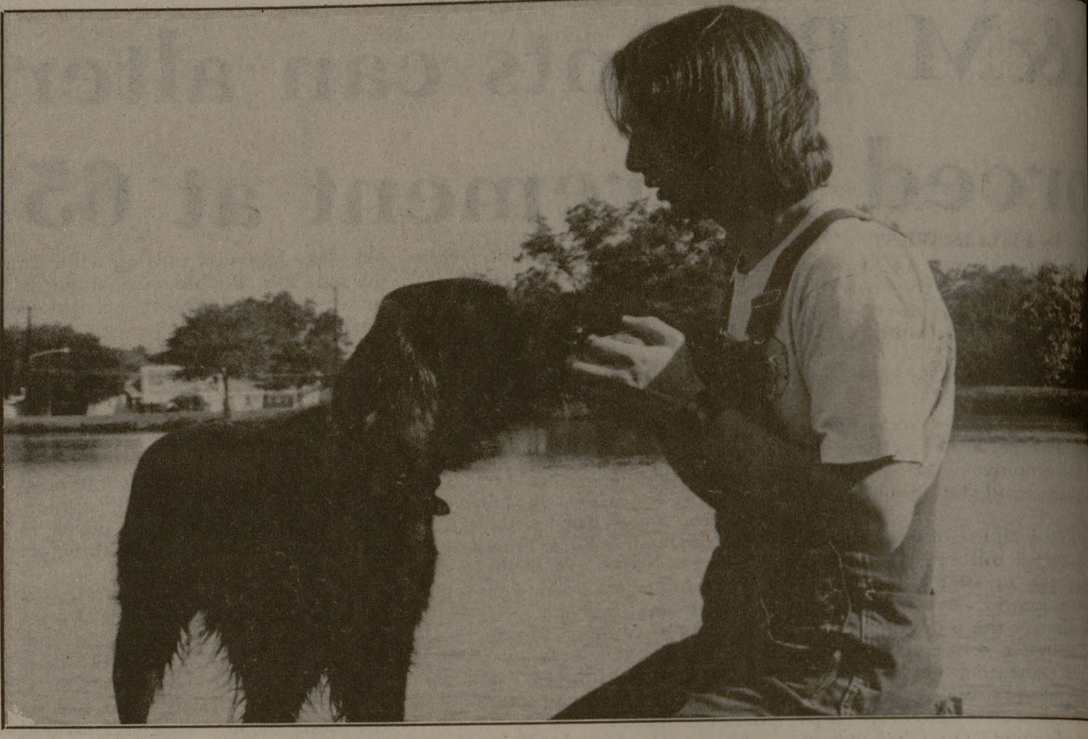
Two buddies play catch