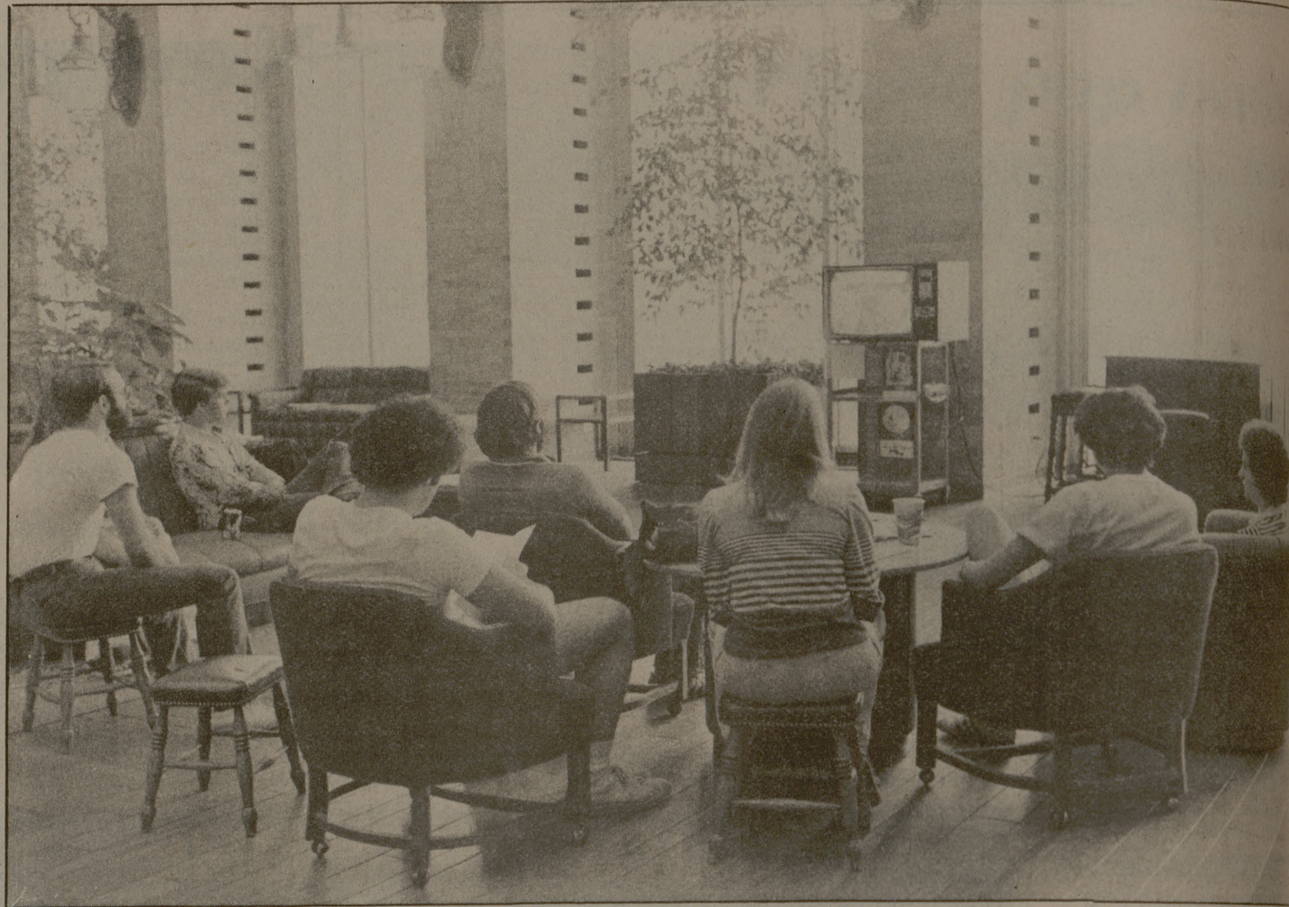
Students gather around one of the four monitors set up by the Video Tape Committee on the first floor in the main lounge of the Memorial Student Center.